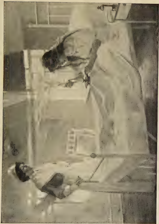
IT BURNED SLOWLY AT FIRST